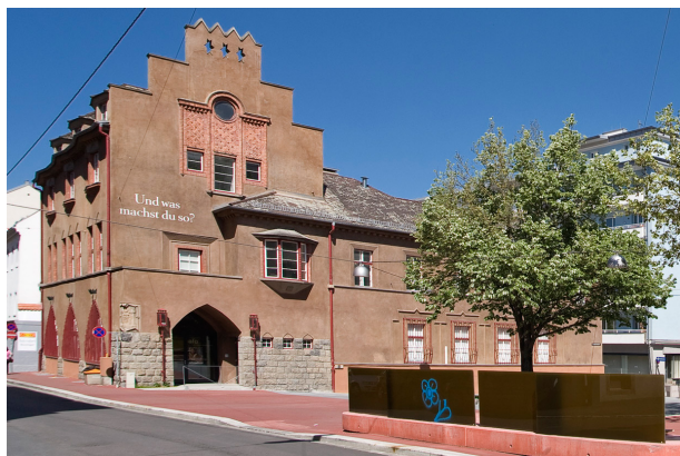
afo